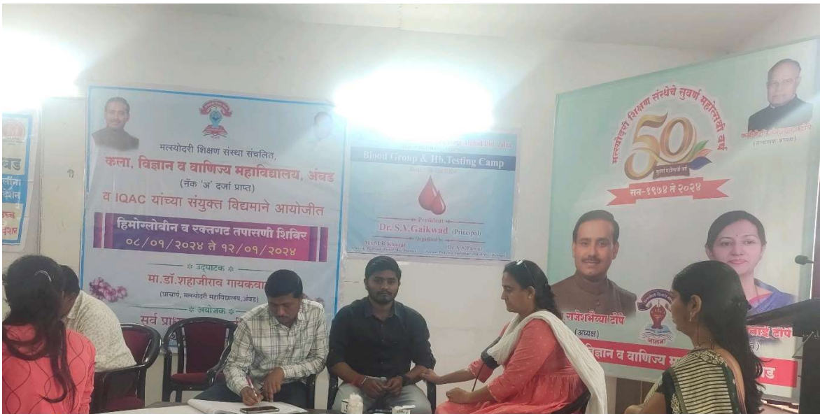
College Staff Member