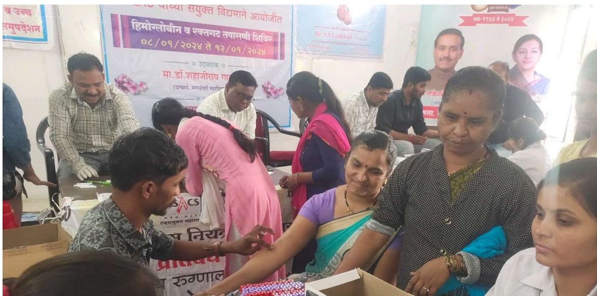
College worker Member