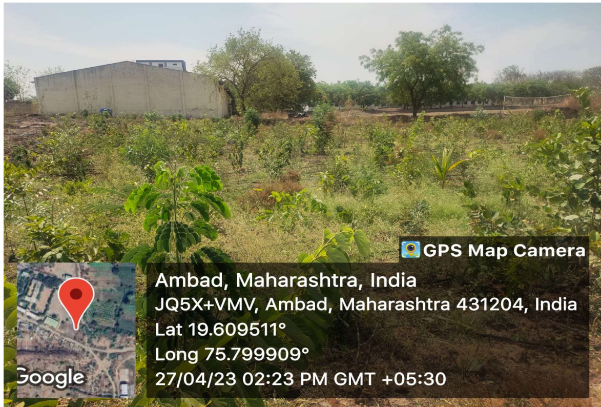
Dense forestry program