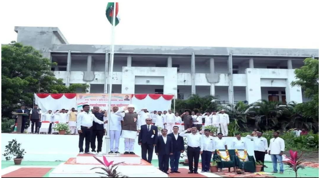
15th August 2022 Independence