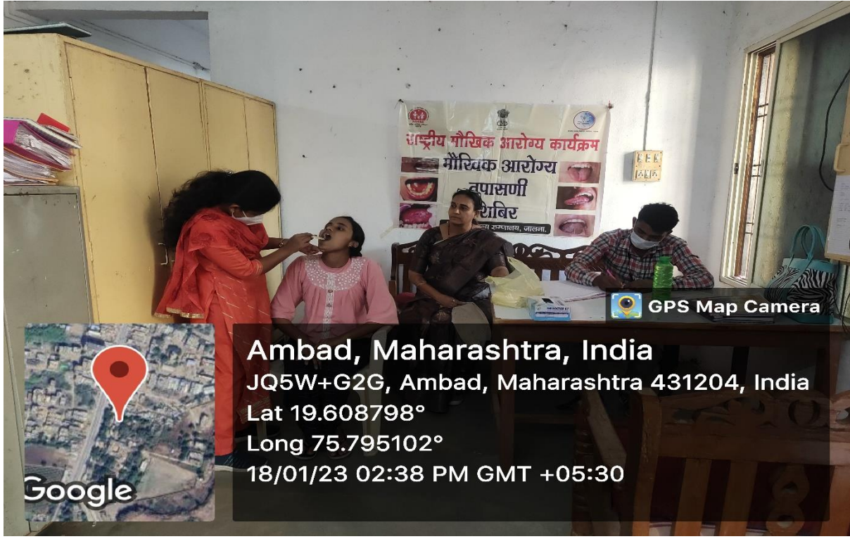
Students participating in Health Checkup Camp.