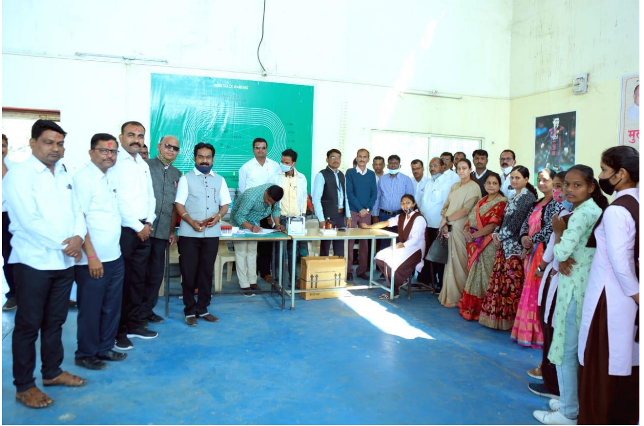
Team of Rural Sub District Hospital During Health Check Up of Girls.